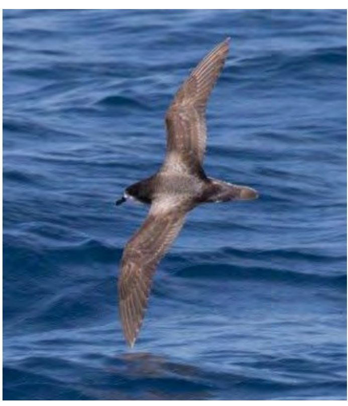
Gould's Petrel.

About seven miles from the heads a large number of shearwaters could be seen to the south of us. We approached and soon noticed large numbers of Shortbeaked Common Dolphins porpoising at speed towards us. Unlike Risso's, Commons rarely avoid boats and the sight of these guys travelling at 15 knots + in a tight formation gave the day its "David Attenborough" moment (thanks Nigel). These guys are commonly seen, but all agreed that this pod was something special as they leapt clear of the water, quite something in large seemingly synchronised groups. Quite a few Flesh-footed Shearwaters were in company with the Wedge-taileds.