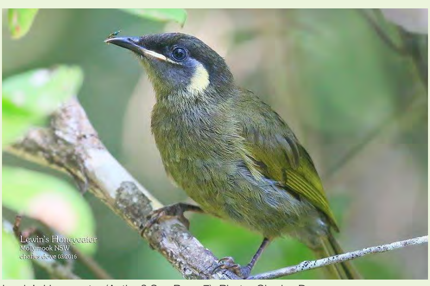
Lewin's Honeyeater (Anting? See Page 7).