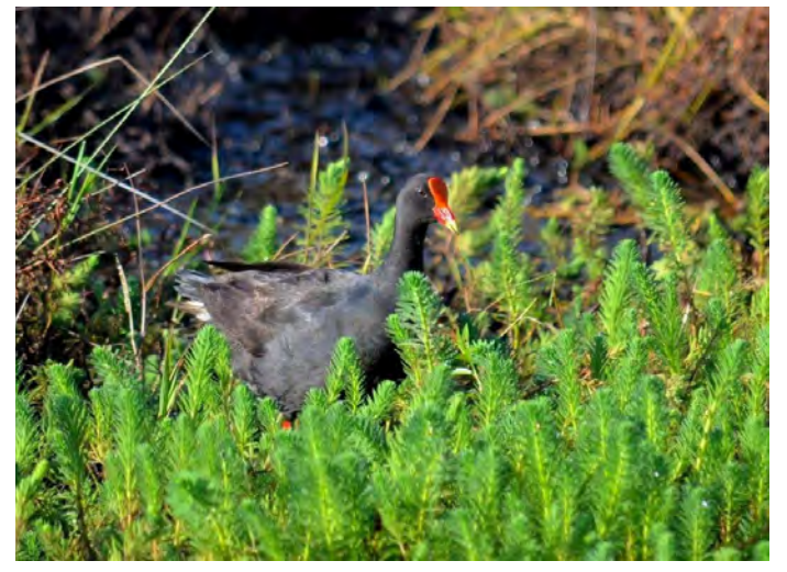
Dusky Moorhen.

After lunch we visited Tuggerah STW where we had hoped to see Pink-eared Ducks but they eluded us but we did get some Hoary-headed Grebe, an immature Musk Duck, Reed Warblers, eight Shovellers, two Wedge-tailed Eagles and