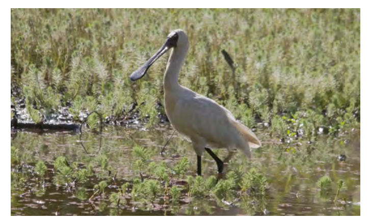
Royal Spoonbill.

A White-Bellied Sea-Eagle near the waterfall in Irrawong reserve brought the raptor count to two. During lunch a Spangled Drongo was heard and although it couldn't be found the subsequent search for it brought the species count for the day to 50.