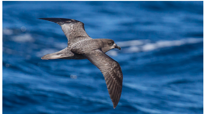
Providence Petrel.

(stedi) or possibly that the nominate race ( cauta ) does not show this characteristic at this time of the year. Before leaving Brown's Mountain, some people on board spotted a Buller's Albatross fly by but the call did not get to everyone unfortunately. A Brown Skua showed well, but with no new species appearing for a while and the wind freshening, we set off back to Sydney.