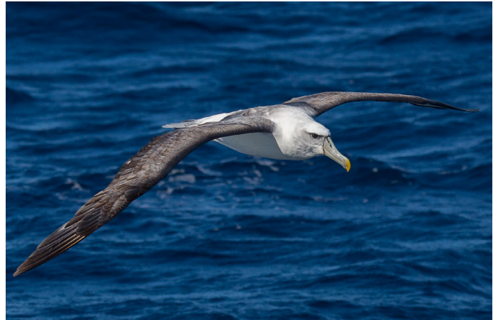
Shy Albatross.

As we were approaching Brown's Mountain, a small group of Oceanic Bottlenose Dolphins was briefly seen but they did not approach the boat and quickly disappeared. We set up a berley slick as the wind began to freshen and there was plenty of activity around the boat. The first of two Antipodean Albatross (Gibson's subspecies), adult Campbell Albatross, small numbers of Providence Petrels, and some very smart-looking juvenile Shy (White-capped) Albatross straight from fledging at their New Zealand breeding grounds were all seen along with the good numbers of Black-browed Albatross, Indian Yellow-nosed Albatross and Fairy Prions. It was of interest that none of the adult Shy Albatross was seen with a yellow base to the culmicorn, which may have indicated that these birds were all White-capped Albatross