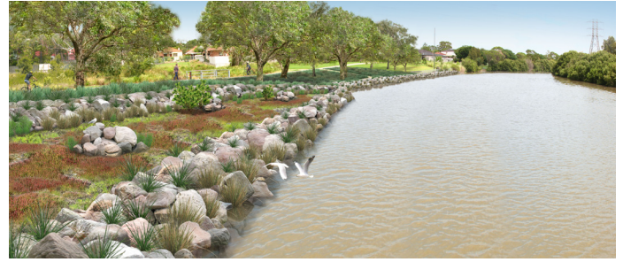
Artist's Impression of the Cooks River Naturalisation Project

Sydney Water has started work to naturalise three areas along the Cooks River. Naturalisation involves removing the deteriorated concrete bank lining the river and replacing it with sandstone and creating a more natural environment surrounding the river by planting shrubs and trees that are indigenous to Cooks River. The areas being naturalised are at Belfield, Campsie and Canterbury, with over 1.1 kilometres of the riverbank naturalised, with construction finishing in mid-2014.